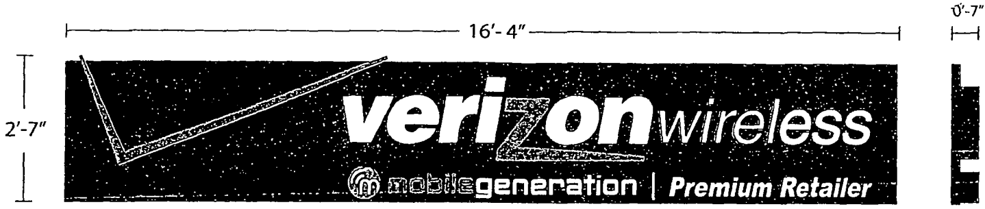
Typical Wireway Mount channel Letters with LED's