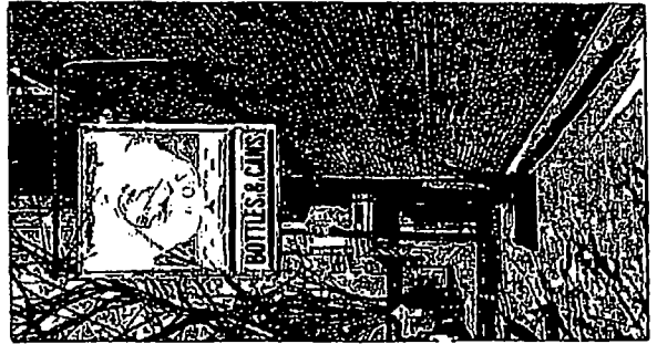
AFTER (SIGN IS EXISTING)