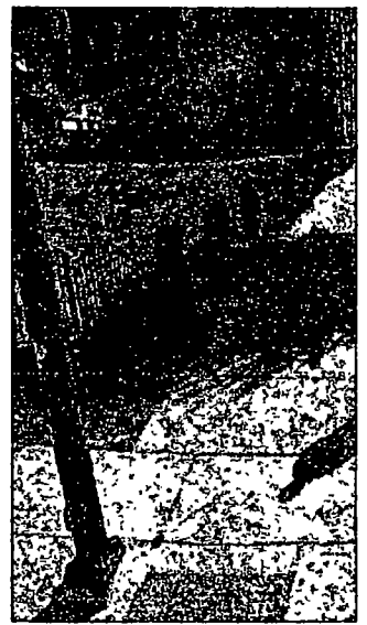
Southwest and 51st S