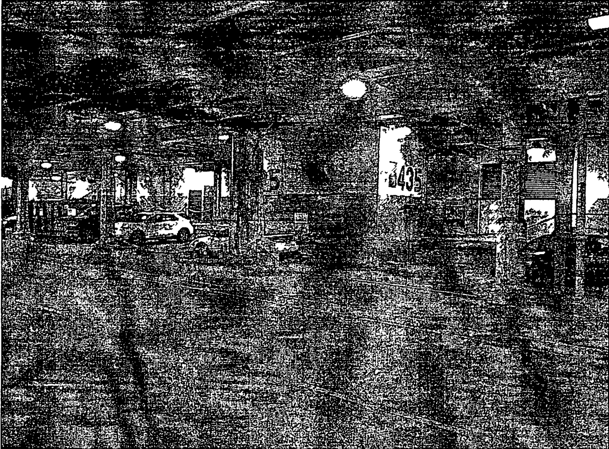
435 N Michigan Avenue (Lower) Elevator and Vault