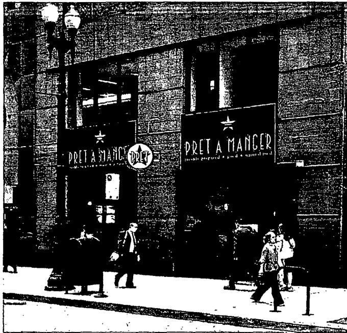
FRONTAGE = 32'5" DISTANCE FROM CURB TO BUILDING = 18'

★ 100 N. LaSALLE / CHICAGO (1) 36" x 36" x 6" (D) PROJECTING SIGN DISPLAY