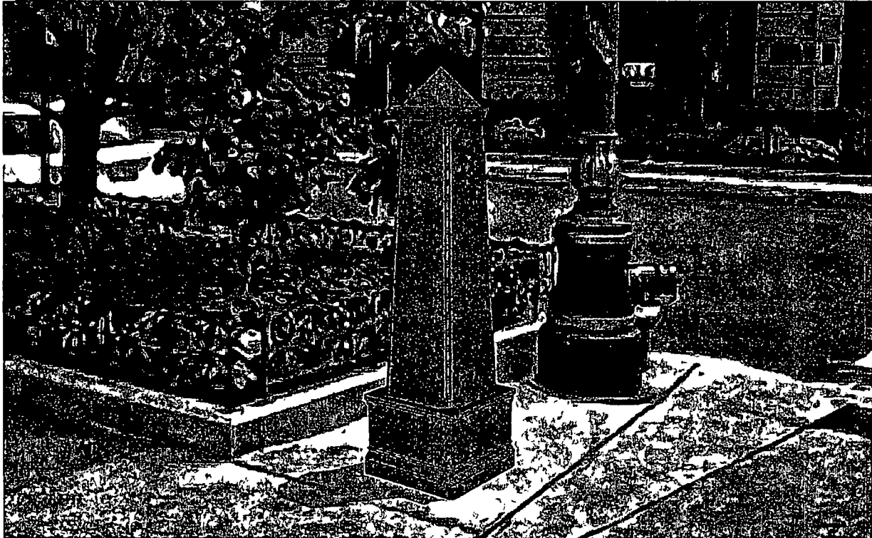
Southeast View of Marker