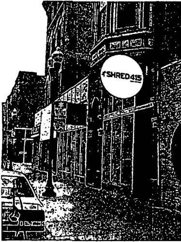
OPTION 2 / WHITE

REFACE (1) 4' 6" (DIA.) EXISTING D/F NON-ILLUMINATED COIN SIGN 02-10-14 / OPTIONS