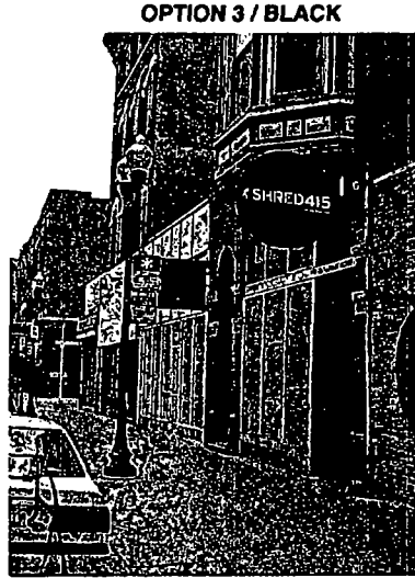
OPTION 3 / BLACK