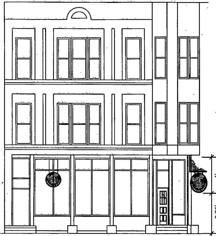
NORTH ELEVATION (TAYLOR ST) SCALE 1/8"=1'-0"