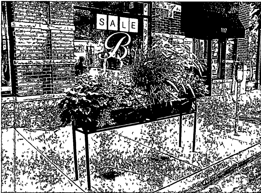
1117 W Armitage