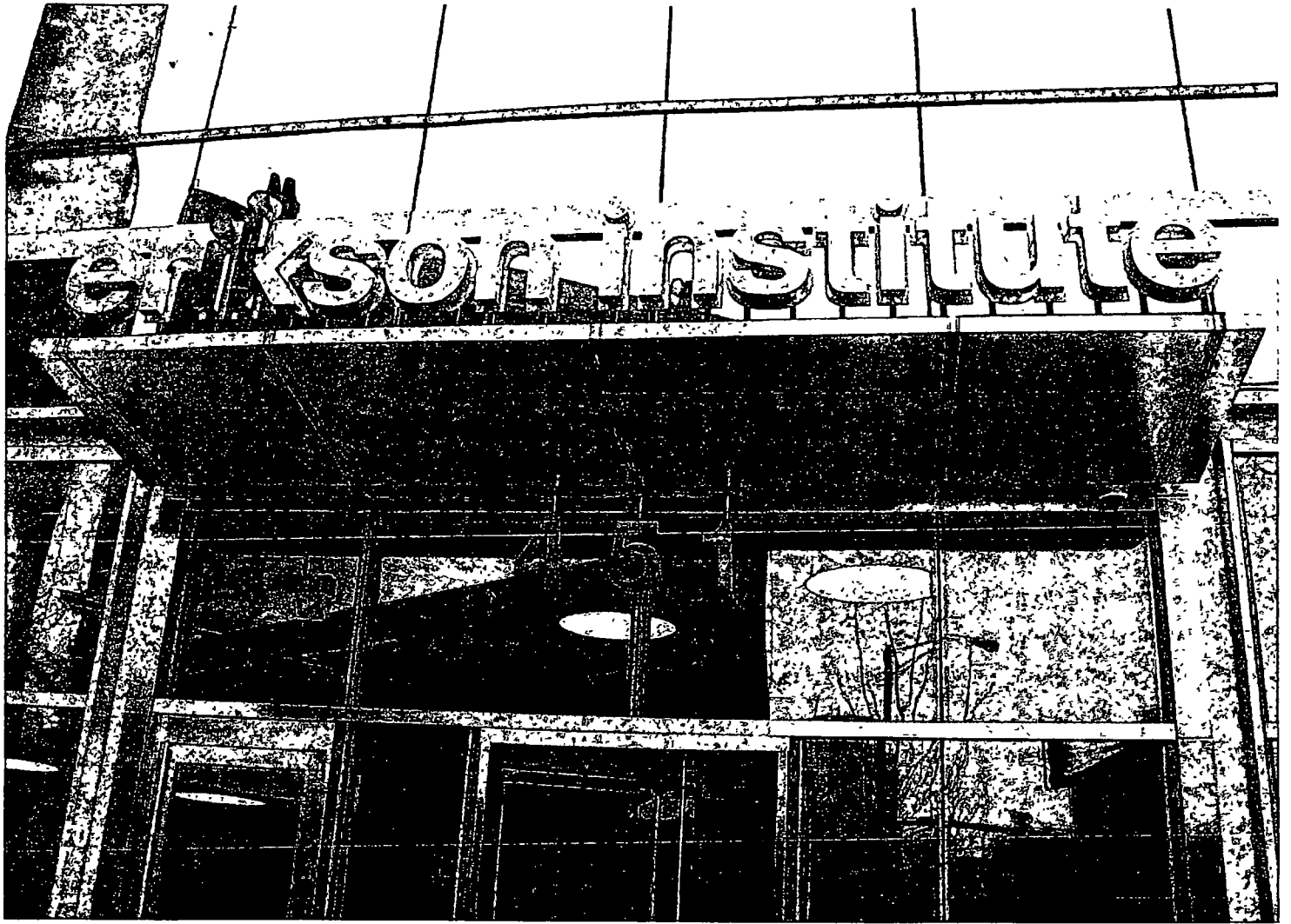
W. Illinois Street. Length - 20', Width - 5.5', Height - 13.4'