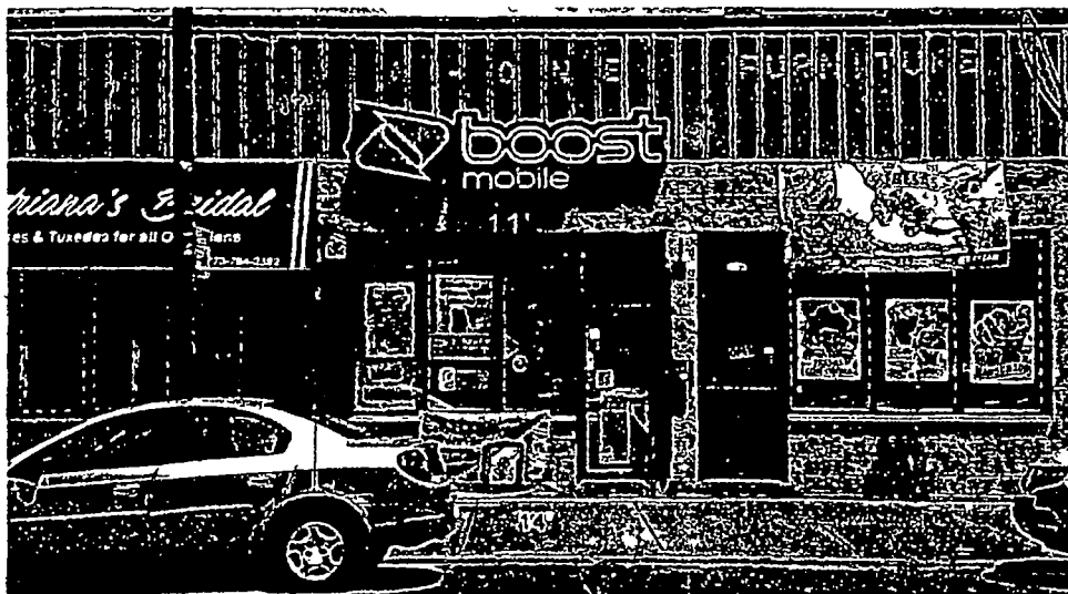
Channel Letters & wall cr