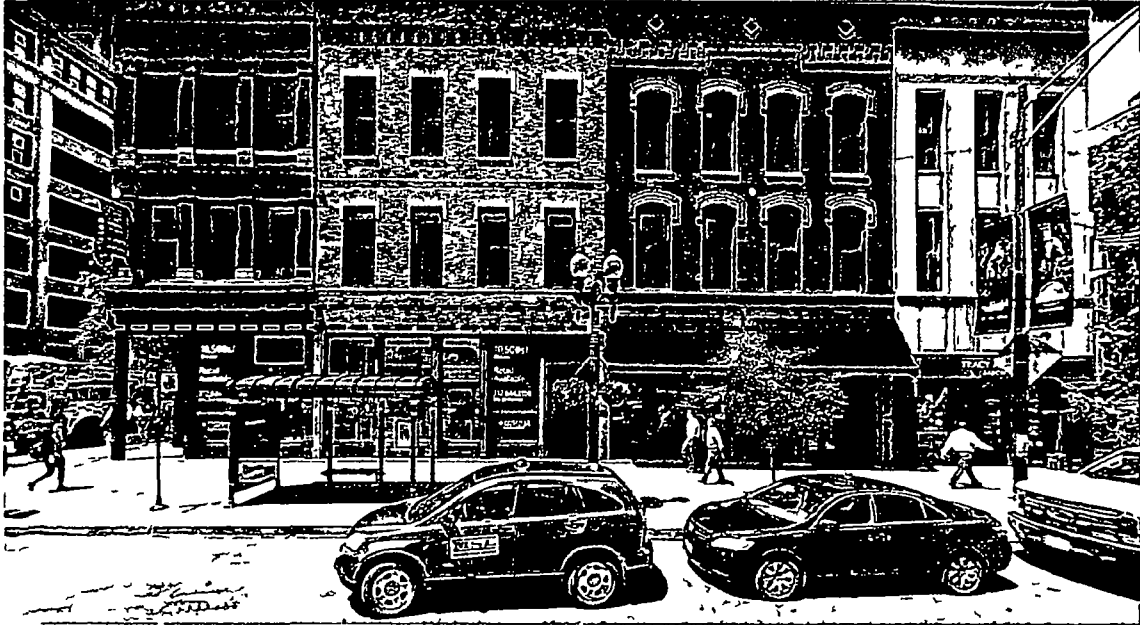
North Clark St Elevation-Proposed Awning Location