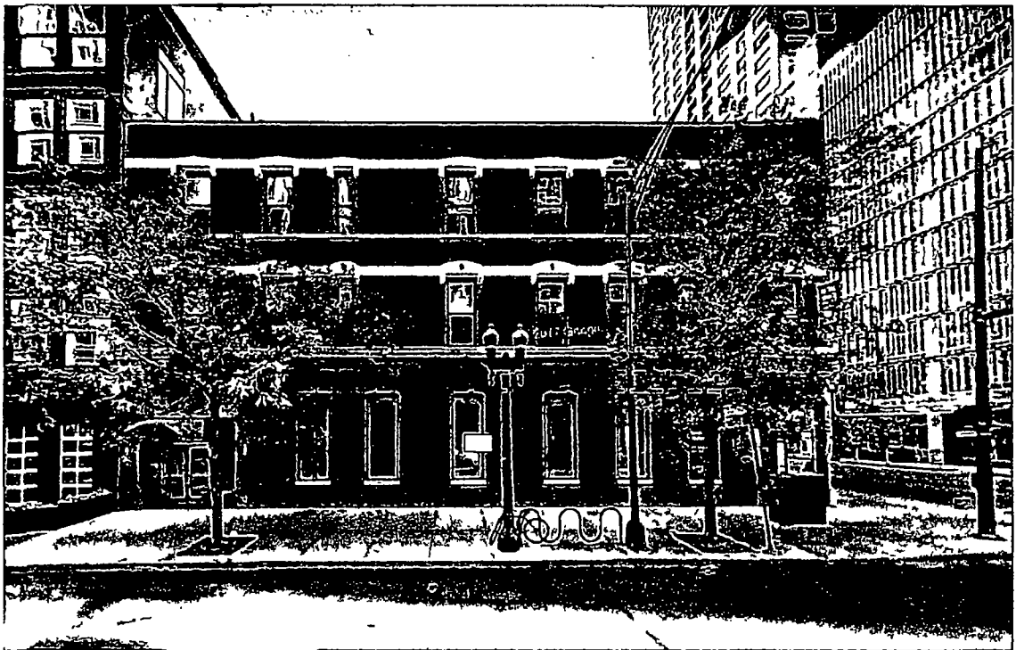
West Kinzie St Elevation-Proposed Awning Location