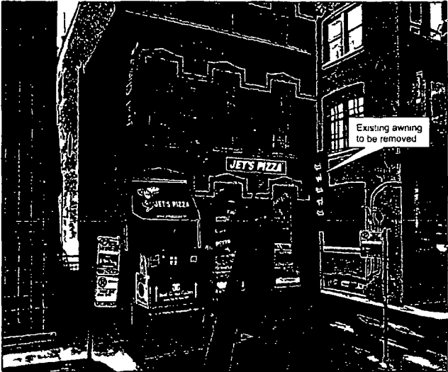
Illustrative View Before & After