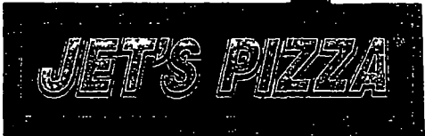
Simulated "HALO" Nighttime Appearance

Drawing Date 10-20-16 Client Jets Pizza Project Name Wall Sign Location 207 W Superior Chicago IL