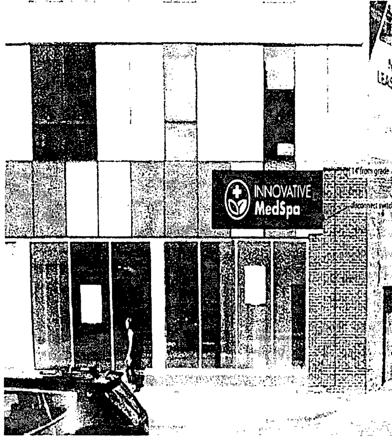
Flush mounted low voltage LED Channel Letters / Logo on 3" deep panel Aluminum returns/cans with acrylic faces and gemlite trim cap