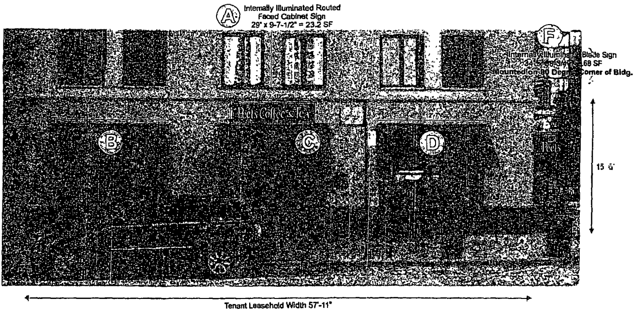
Storefront Elevation Scale 1/8" = 1'