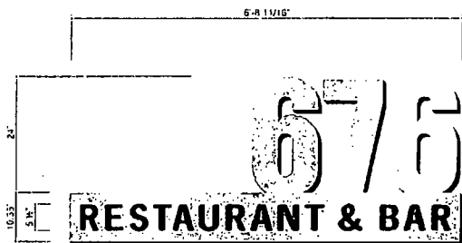
S/F LED & H.O. FLD. INT. ILLUMINATED REVERSE CHANNEL LETTER DISPLAY 3/4" = 1'-0"

* ALUMINUM CHANNEL LETTERS & FACES. MAP BRUSHED ALUMINUM PAINTED FINISH W/ ROUTED COPY & 3/4" CLEAR PLEX PUSH-THRU W/ 3035-222 3M BLACK DAY/NIGHT VINYL APPLIED COPY & WHITE PLEX BACK-UP WITH DIFFUSE FILM.