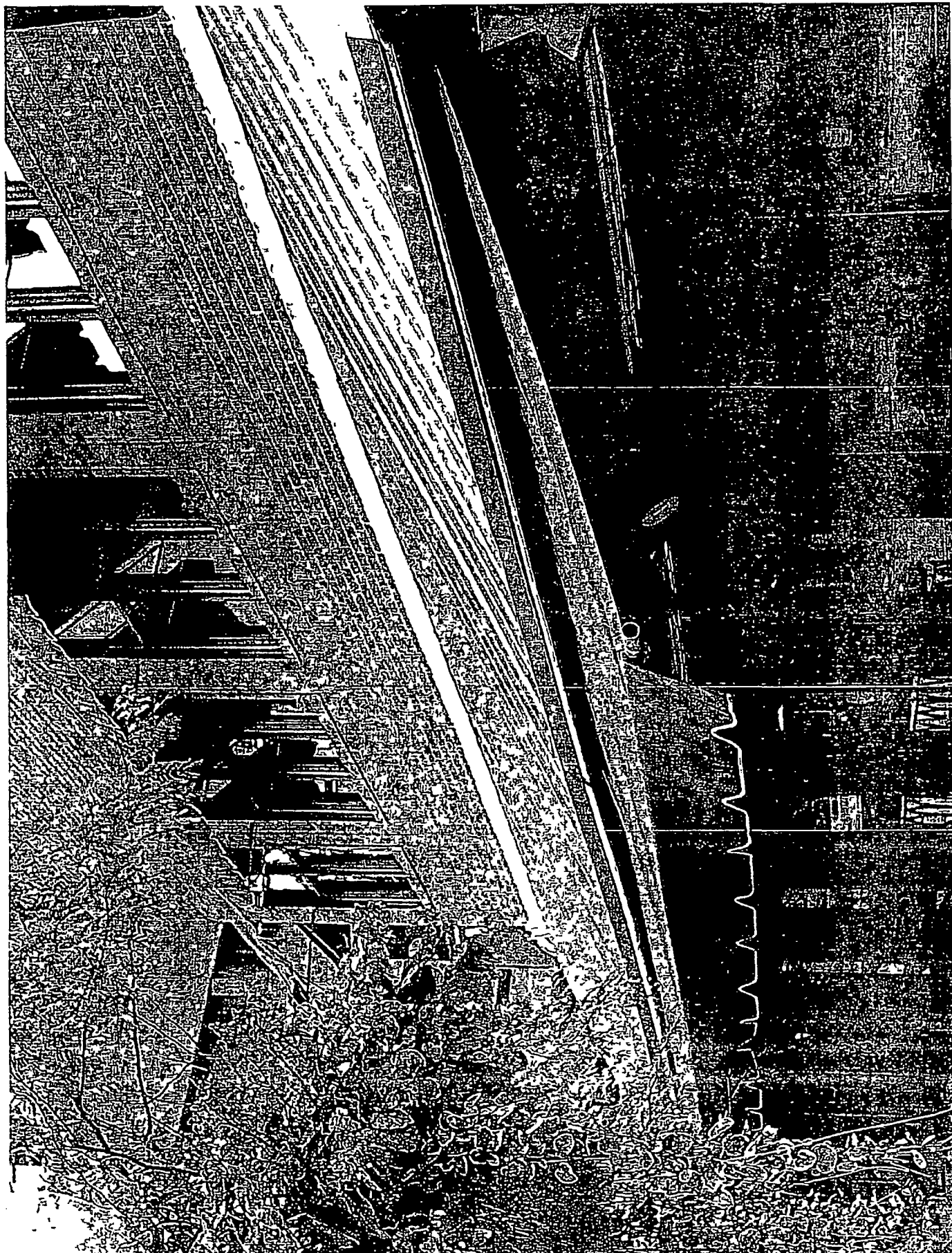
(4) BELLEVUE ST ANGLE 2