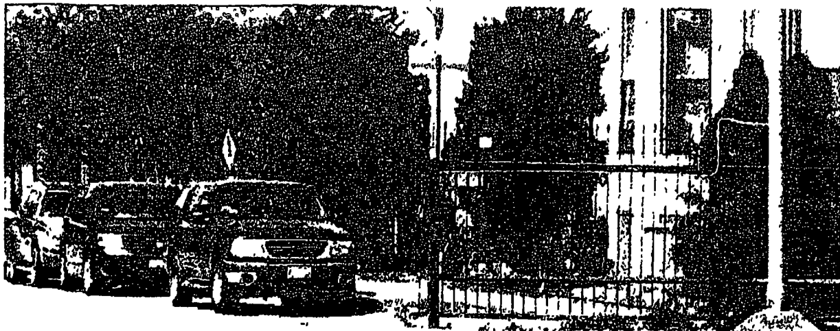
2400 W 42nd ST