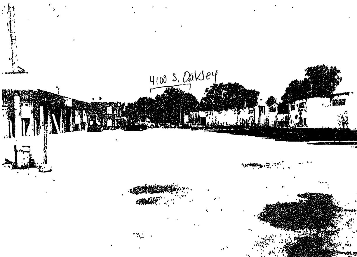
4100 S. Oakley