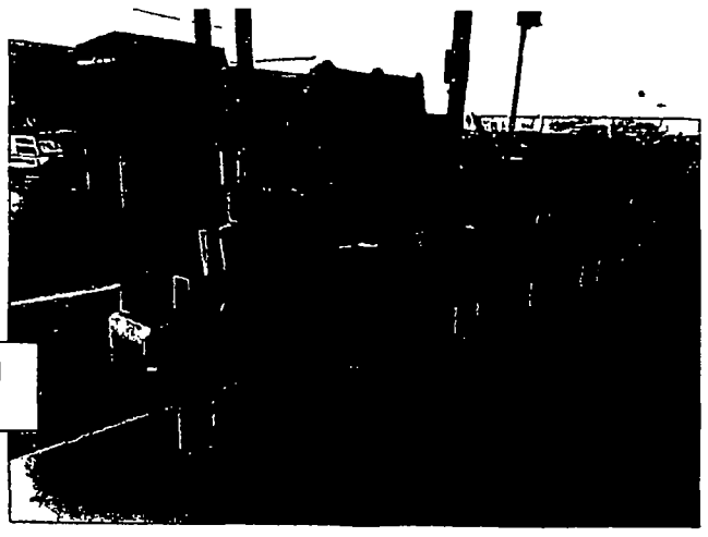
17 Bike Racks on Carroll 42' L x 33' W x 28' D, 2'10" Tall