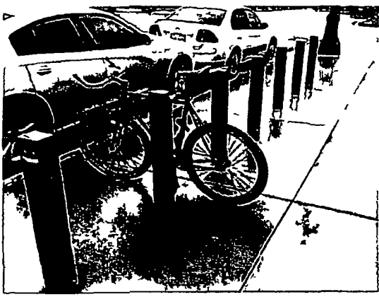
7 Bike Racks on Fulton 42' L x 33' W x 28' D, 2'10" Tall