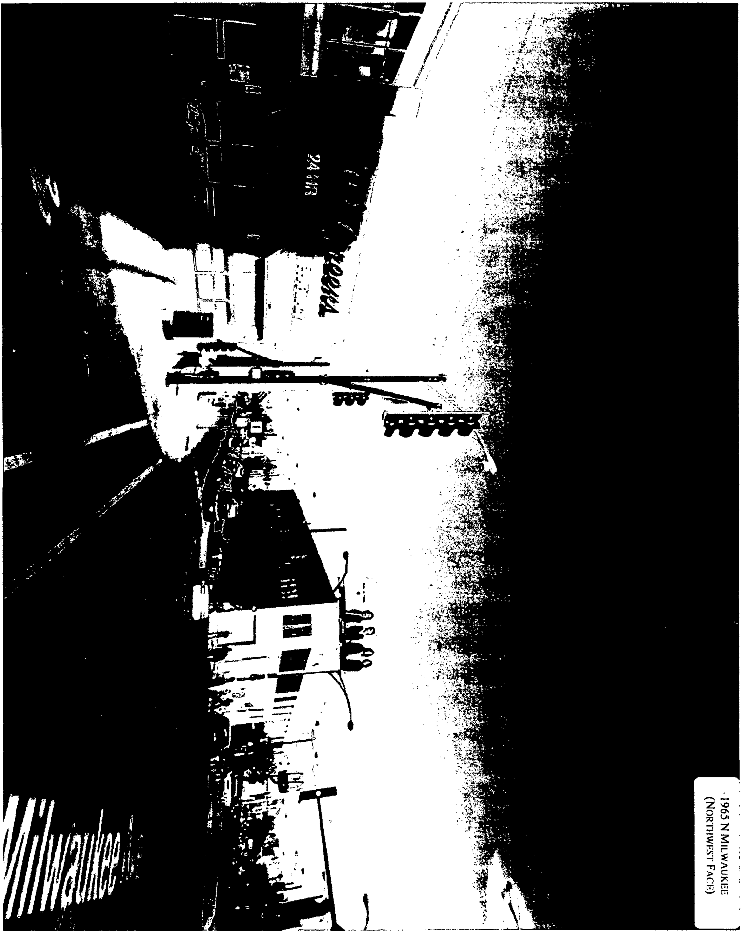
1965 N MILWAUKEE (NORTHWEST FACE)