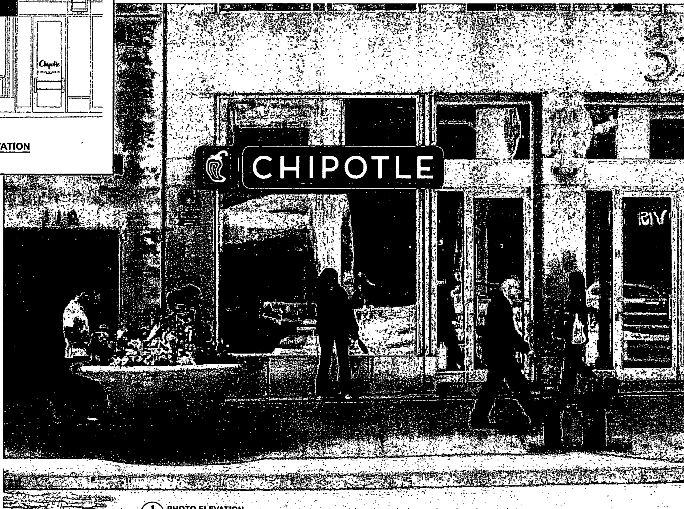
1 PHOTO ELEVATION 1.0 SCALE: NO SCALE