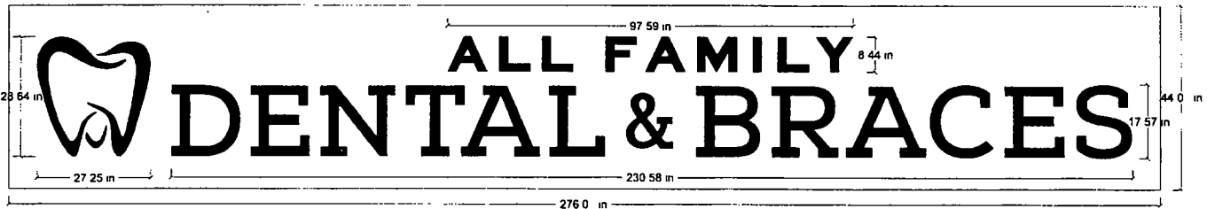
back and front lit channel letters mounted on panel