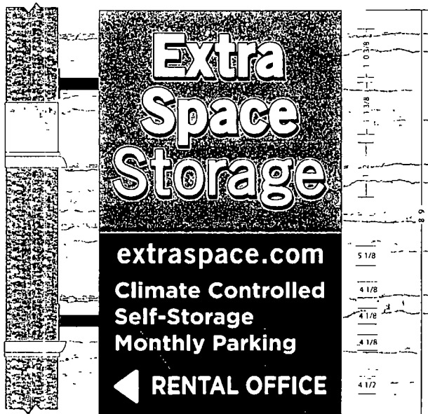
Front View 3/4 = 1-0

THIS DRAWING IS THE PROPERTY OF LANDMARK SIGN GROUP, INC. REPRODUCTION OR LENDITION AS BE NOTED WITHOUT THE WRITTEN CONSENT OF LANDMARK SIGN GROUP, INC. AN AGREEMENT OF UP TO 5,000 REPRINTS IS CHARGED PER ANY ORDER OF THIS DRAWING.