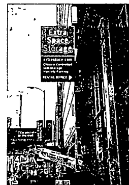
Proposed North East Elevation NTS