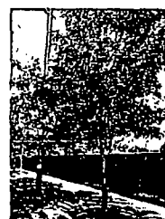
TREE NO. 6