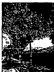
TREE NO. 3