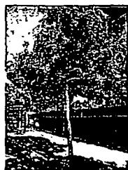
TREE NO. 1