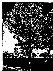
TREE NO. 2