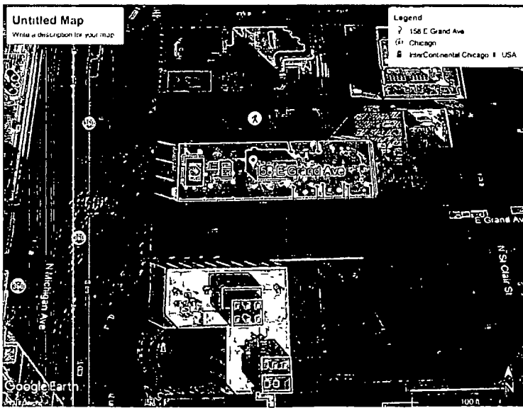
158-160 East Grand Aerial