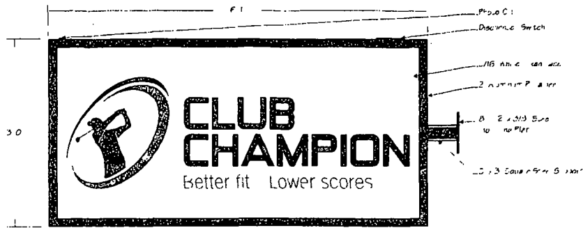
3' 0" x 6' 1" x 10' Deep Double Face Illuminated Cantilever Sign

10 Deep Fabricated Aluminum Cabinet 2 1/2" x 1 1/2" x 1/8" 3/16" White cast acrylic 1/4" 5/16" made translucent Dark Blue (PMS #281) & Apple Green (PMS #376) Vray Applied Cabinet Illuminated by 4 G10 F 100W lamps Proto-Cut Controller Cabinet Protection Mounted On Masonry Wall Signs Chair and Stools as Required 15 Amp Circuit @ 120 Volts Required