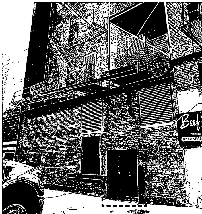
PHOTO OF FACADE - EXISTING SCALE NTS