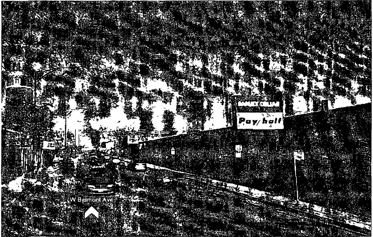
11071-116 Family Dollar 4200 W Belmont Ave Chicago, IL