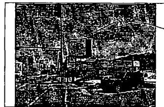
Looking east of existing northwest sign panel