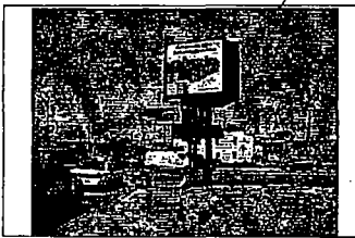
Looking north of existing south sign panel