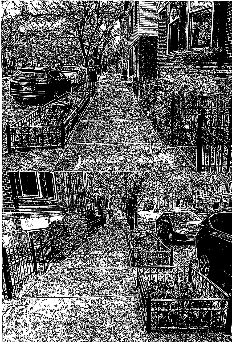
Top Looking South on Sedgwick St Bottom Looking North on Sedgwick St