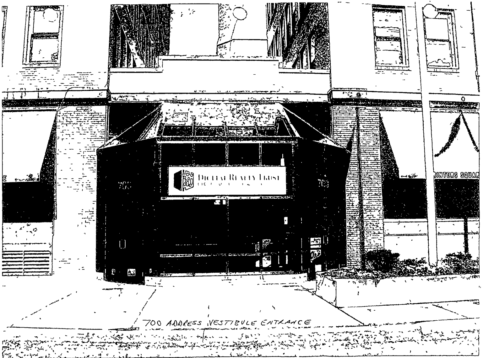
700 ADDRESS VESTIBULE ENTRANCE