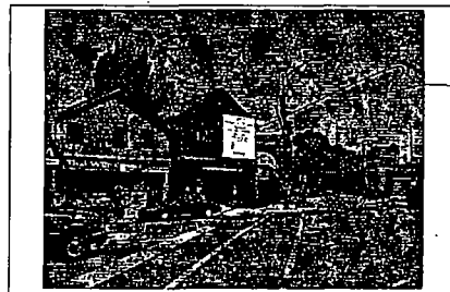
Looking northeast of 2201 Clybourn Ave.