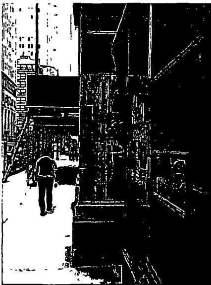
Pilaster on Monroe facing West