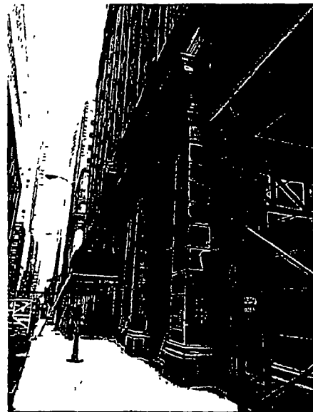
Pilaster on Monroe facing northwest