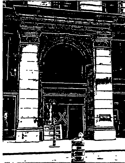
Pilaster on LaSalle facing north