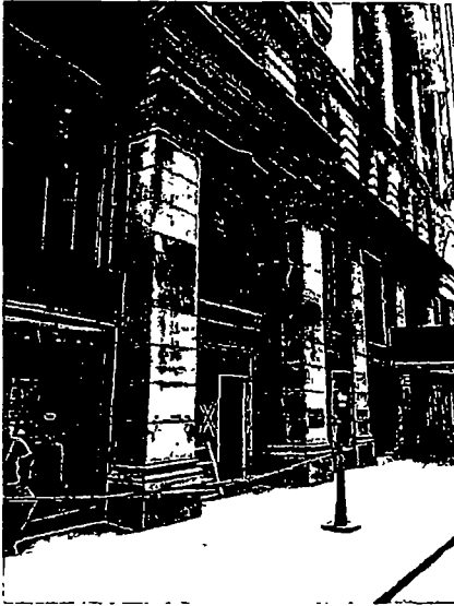
Pilaster on Monroe facing northeast