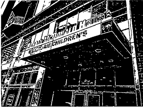
Canopy and signage at 211 East Grand