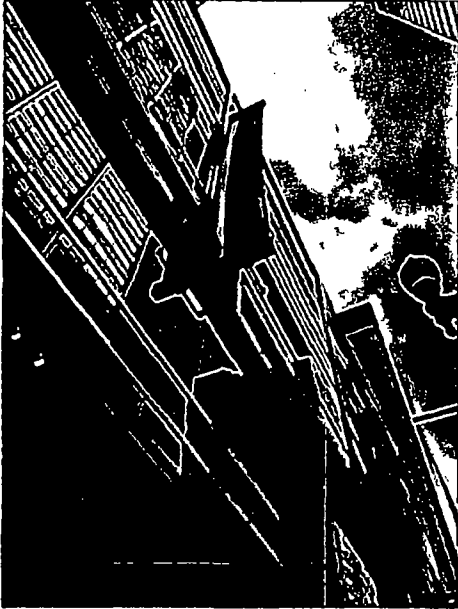
North State Street (Two lights for four banners)