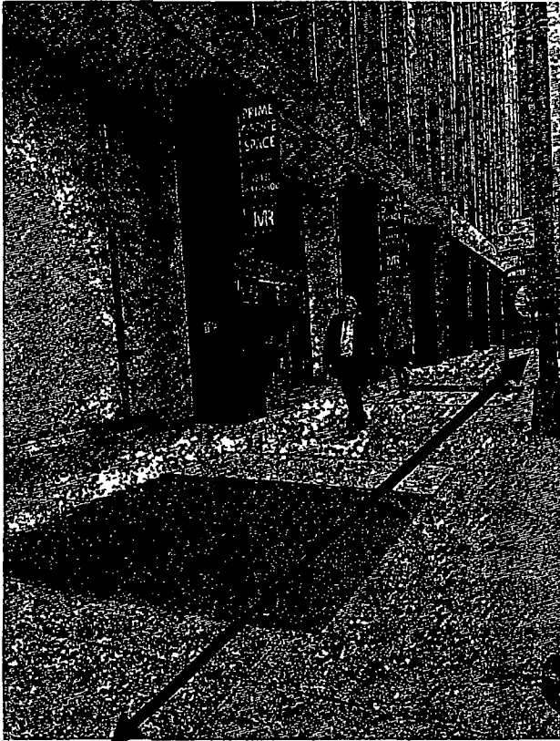
Adams Street Vault 112"L x 12"W