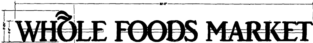
(A) ONE(1) I.L.D. ILLUMINATED CHANNEL LETTER DISPLAY, RACEWAY MOUNTED • FRONT VIEW SCALE: 3/16"=1"