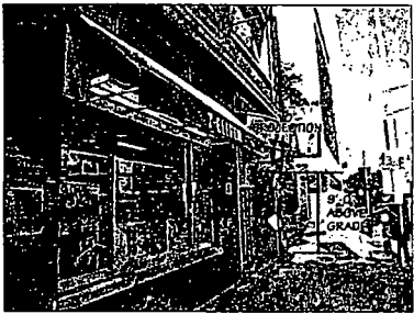
OHIO STREET ELEVATION