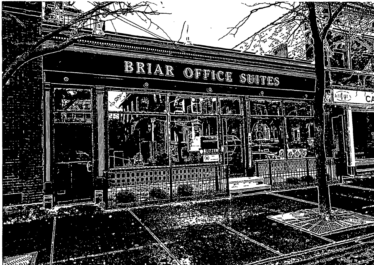
611 W BRIAR