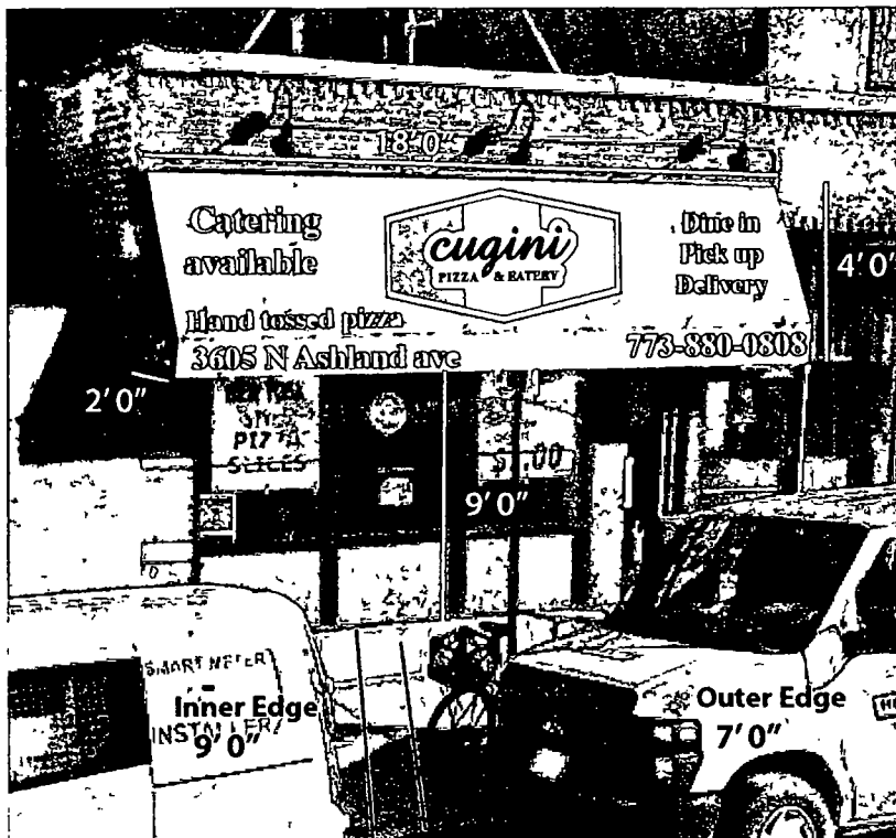
NOTE Photo for representational purposes only Signs are not to scale and may appear larger or smaller than shown