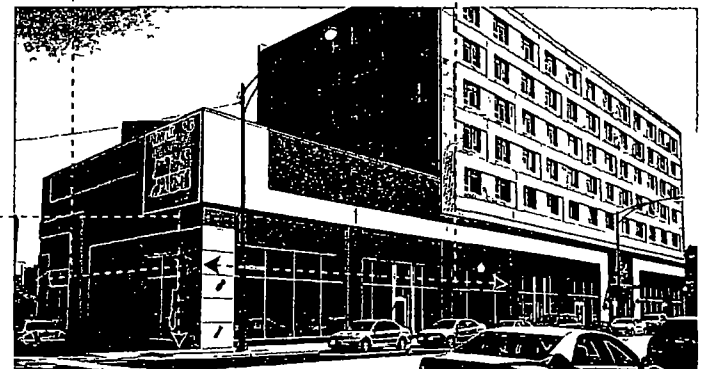
85 6 Division Tenant Frontage