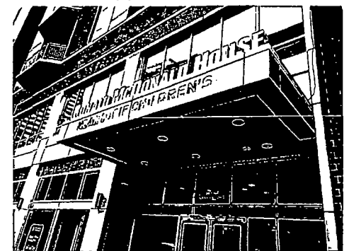
Canopy and signage at 211 East Grand