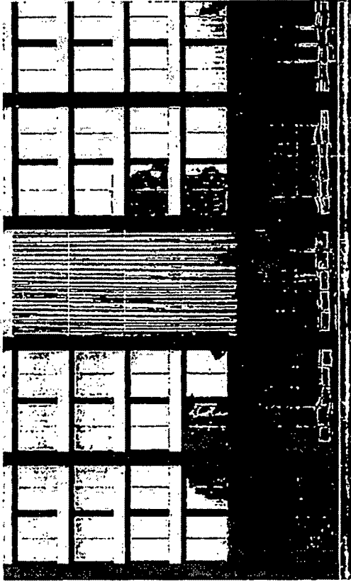
Proposed Locations (N/S)

B1 - GRAPHICS Color: Black Background, White Copy