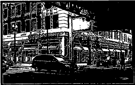
Existing Location Overview