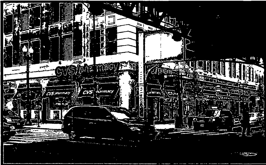
Proposed Signage Overview