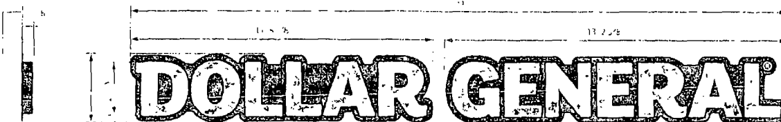
24 TRACEWAY LETTERS W/ BACKER

Front/North Business ID no 016 001 1 012