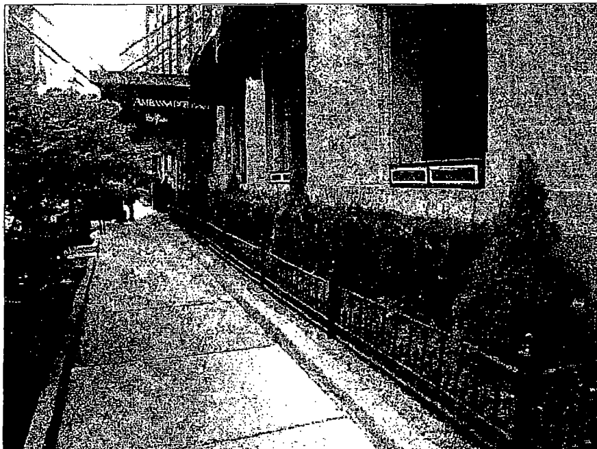
VIEW LOOKING WEST ON GOETHE STREET