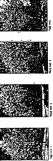
MA 1023 1 TR 1023 1 TR 1023 1 TR 1023 1