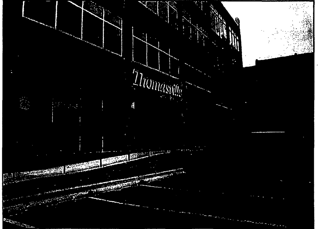
South Building Elevation