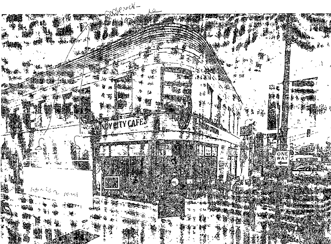
1062 WEST CHICAGO AVE - WEST ELEVATION WITH DEPICTION OF SIGN INSTALLATION