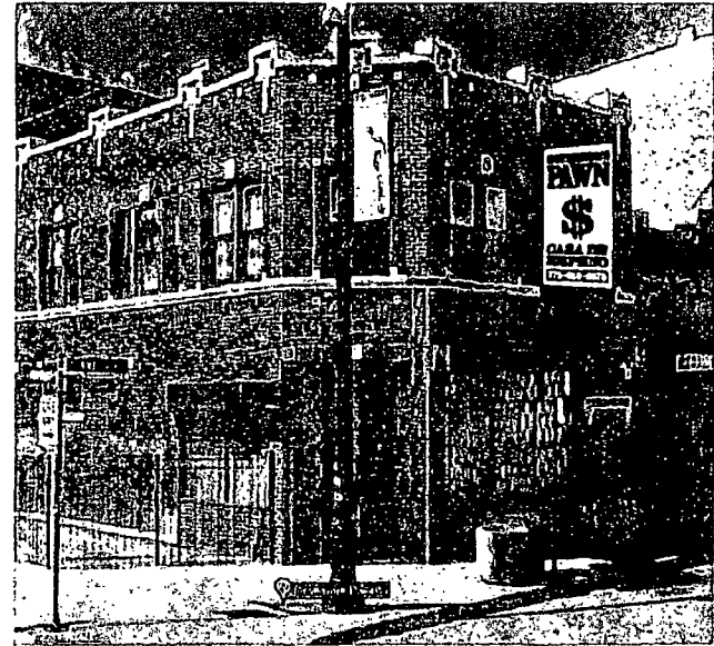
SHOWN ON BLDG